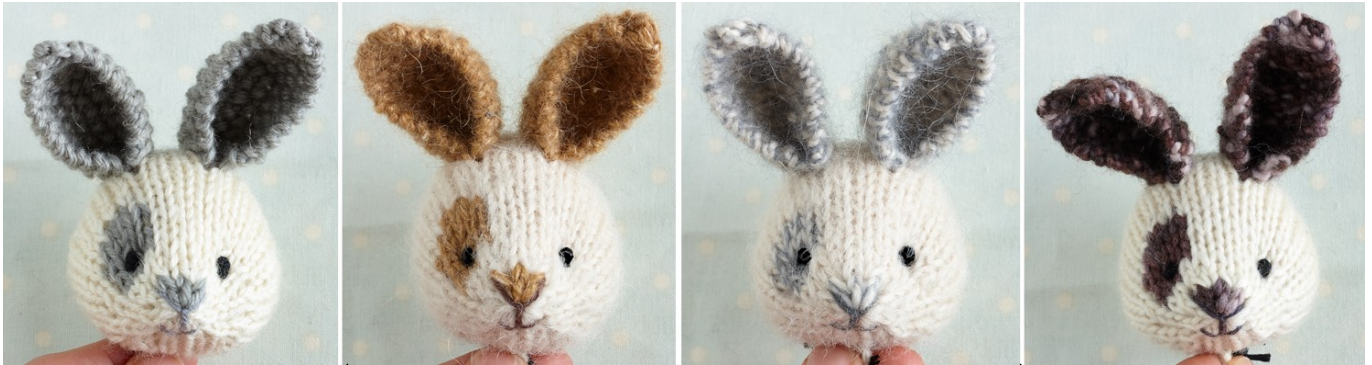
Lana Grossa Canapa in 1 rohweiss and 6 hellgrau